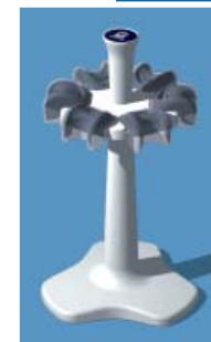
Freely rotatable stand for handy storage of up to 6 Transferpette® S pipettes