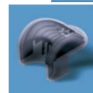
Shelf-rack mount for a single Transferpette® S pipette