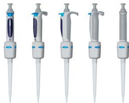
Transferpette® S 10 ml